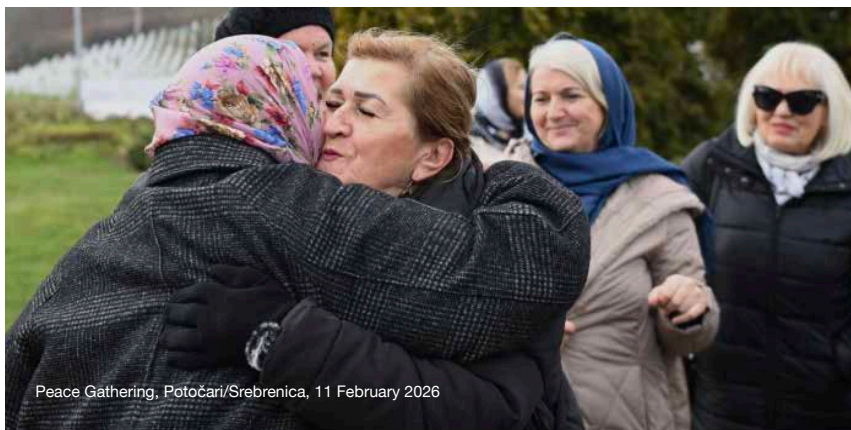
Peace Gathering, Potočari/Srebrenica, 11 February 2026