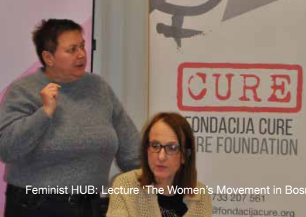
Feminist HUB: Lecture 'The Women's Movement in Bosnia and Herzegovina', Sarajevo, 26 February 2026