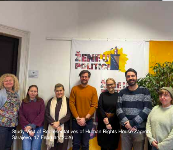
Study Visit of Representatives of Human Rights House Zagreb, Sarajevo, 17 February 2026