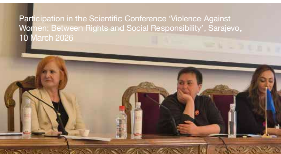
Participation in the Scientific Conference 'Violence Against Women: Between Rights and Social Responsibility', Sarajevo, 10 March 2026