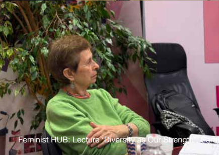
Feminist HUB: Lecture 'Diversity as CURE strength', Sarajevo, 26 March 2026