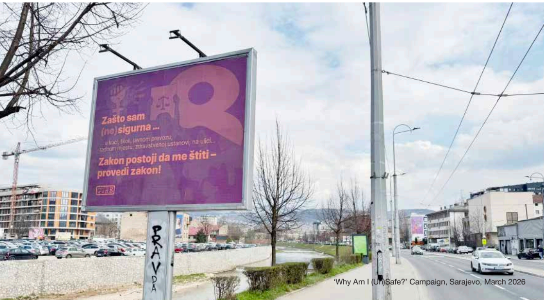
'Why Am I (Un)Safe?' Campaign, Sarajevo, March 2026

We call for institutional accountability and for the creation of a society in which women's safety is finally recognised as a fundamental human right rather than a privilege.