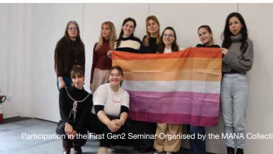
Participation in the First Gen2 Seminar Organised by the MANA Collective, Novi Sad, 26–20 January 2026

Through the exchange of experiences, knowledge and good practices, the seminar once again confirmed the importance of solidarity and collective learning in creating safer and more equitable spaces for all. Gatherings such as this continue to inspire us to build strong alliances and push the boundaries of inclusive and accountable work across the region throughout 2026.