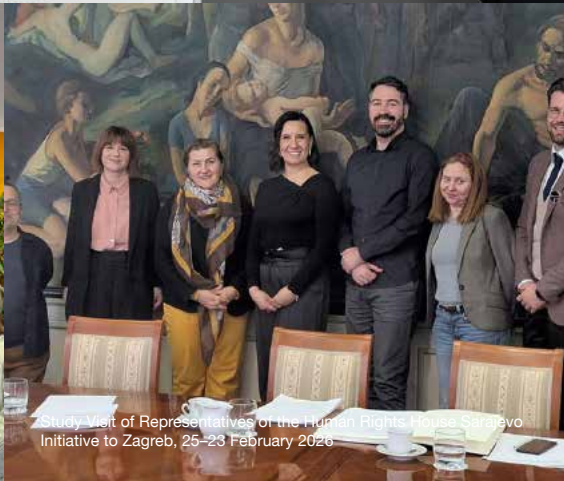
Study Visit of Representatives of the Human Rights House Sarajevo Initiative to Zagreb, 25–23 February 2026