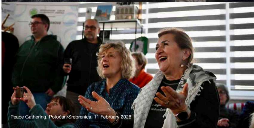
Peace Gathering, Potočari/Srebrenica, 11 February 2026