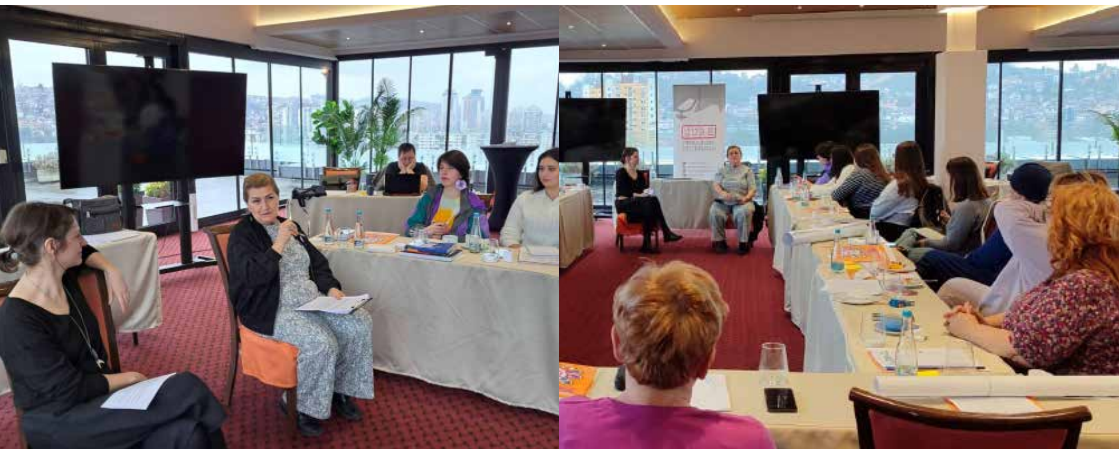
Workshop for Women Activists and Defenders of the Rights of Women and LGBT*IQ Persons, Sarajevo, 5–8 February 2026

A dedicated part of the workshop focused on an online campaign simulation, during which participants strengthened their communication skills and practised responding to provocative questions, with the aim of increasing resilience and promoting safer engagement in digital spaces.