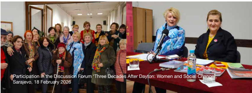
Participation in the Discussion Forum ‘Three Decades After Dayton: Women and Social Change’, Sarajevo, 18 February 2026

Particular emphasis was placed on the importance of documenting feminist activism and recording women’s contributions to social change. On this occasion, we presented several Foundation CURE publications that share stories of women and their experiences of survival, resistance and everyday life in Bosnia and Herzegovina.