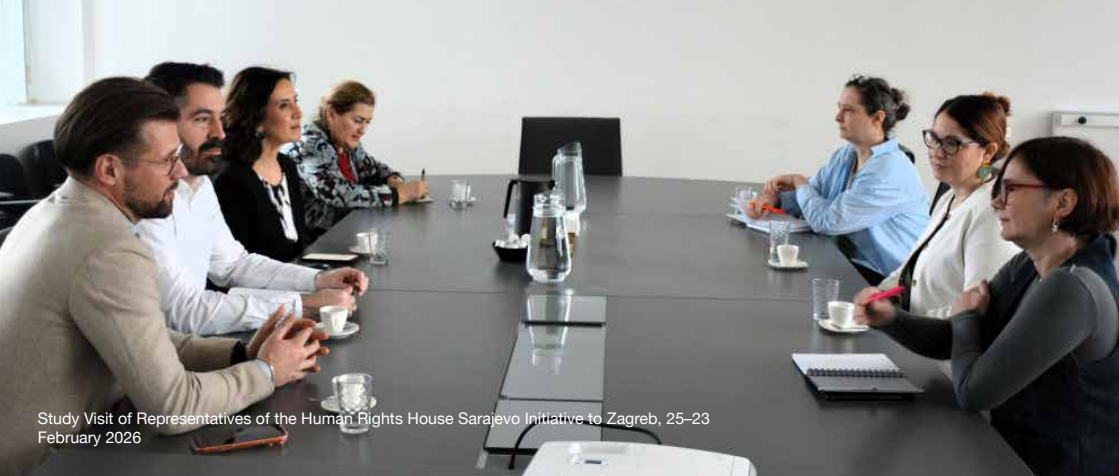
Study Visit of Representatives of the Human Rights House Sarajevo Initiative to Zagreb, 25–23 February 2026