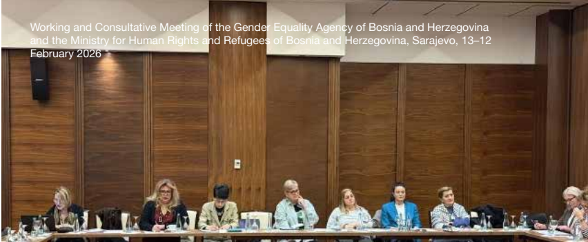
Working and Consultative Meeting of the Gender Equality Agency of Bosnia and Herzegovina and the Ministry for Human Rights and Refugees of Bosnia and Herzegovina, Sarajevo, 13–12 February 2026