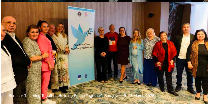
Seminar 'Learning Together, Building Peace Together', Sarajevo, 15-13 March 2026