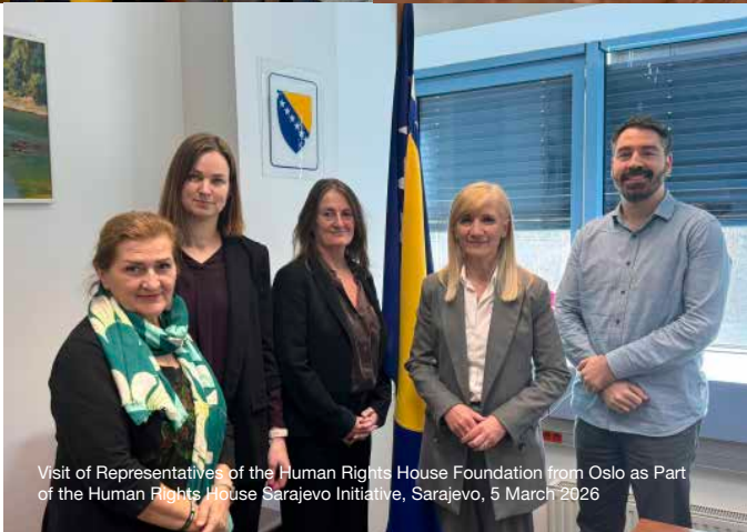
Visit of Representatives of the Human Rights House Foundation from Oslo as Part of the Human Rights House Sarajevo Initiative, Sarajevo, 5 March 2026