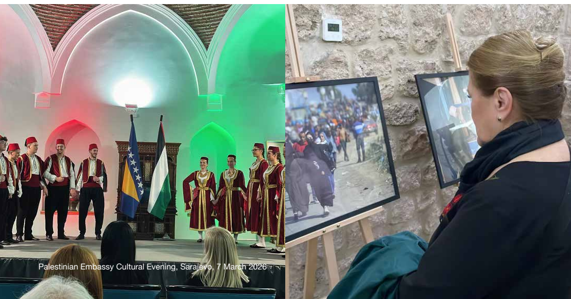
Palestinian Embassy Cultural Evening, Sarajevo, 7 March 2026

The Ambassador delivered an inspiring speech on the ways in which women often bear the burden of war to a greater extent than men, emphasising that International Women's Day is not only an occasion for commemoration, but also an opportunity to recognise, respect and affirm the role of women in society.