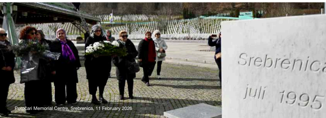
Potočari Memorial Centre, Srebrenica, 11 February 2026

From 13 to 15 March, a representative of the CURE Foundation participated in the seminar 'Learning Together, Building Peace Together', held in Sarajevo at the invitation of the Romani Girl Association – Romani Čej from Prnjavor. During the seminar, she spoke about peacebuilding and reconciliation, as well as support for women, with a particular focus on marginalised women, Roma women, and returnee women.