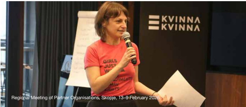
Regional Meeting of Partner Organisations, Skopje, 13–9 February 2026