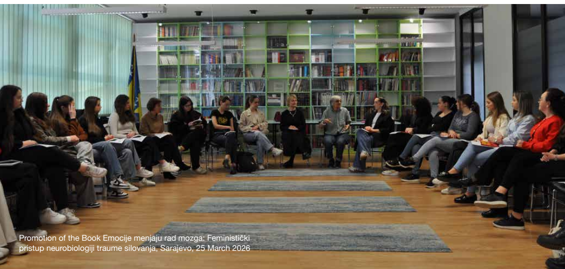
Promotion of the Book Emocije menjaju rad mozga: Feministički pristup neurobiologiji traume silovanja , Sarajevo, 25 March 2026

In response to the continued absence of constitutional amendments explicitly guaranteeing gender equality, the Initiative submitted a letter to the Working Group of the Council of Ministers of Bosnia and Herzegovina on 11 March 2026, calling for the inclusion of gender-sensitive language in constitutional and legislative reform processes and emphasising the crucial role of language in ensuring the visibility of women and advancing substantive gender equality.