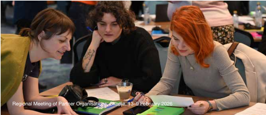
Regional Meeting of Partner Organisations, Skopje, 13–9 February 2026

The meeting concluded with the identification of shared regional priorities, including combating violence against women, protecting women human rights defenders, challenging anti-democratic narratives and strengthening support for feminist civil society.