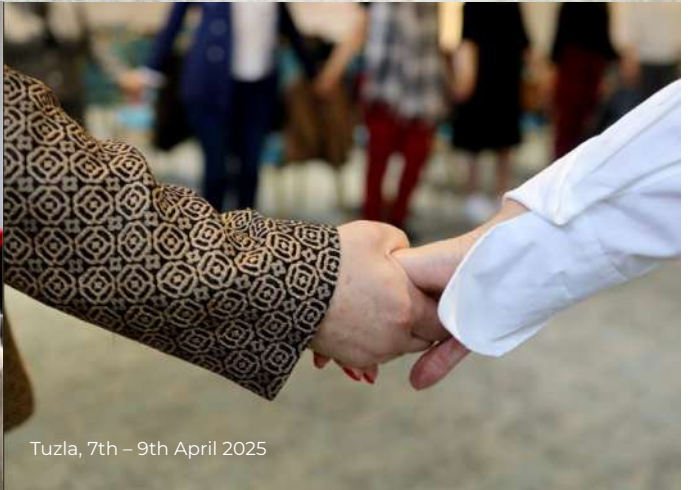
Tuzla, 7th – 9th April 2025