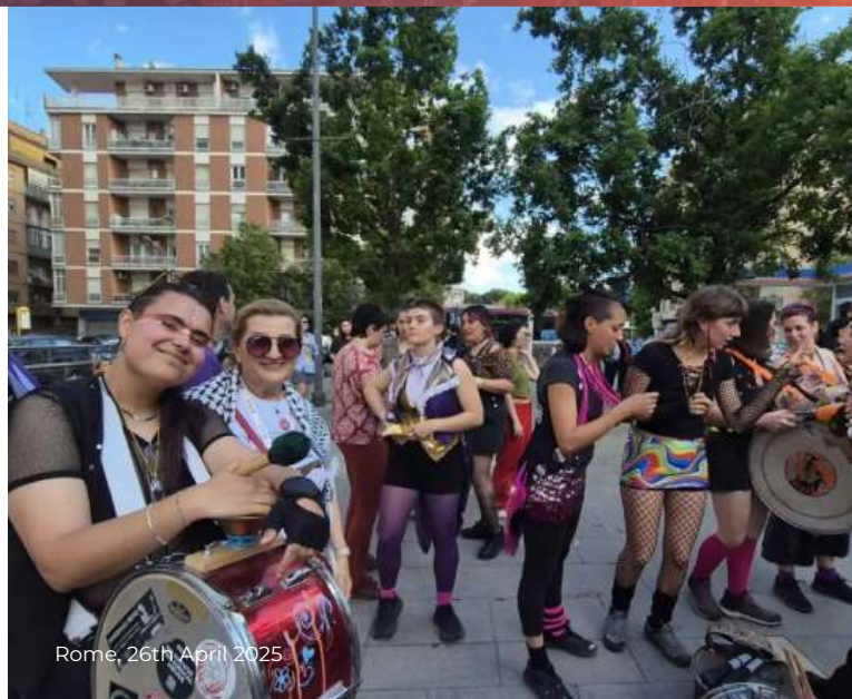
Rome, 26th April 2025

From 23rd to 26th April 2025, the Fourth Conference of the EuroCentralAsian Lesbian* Community (EL*C) was held in Rome, bringing together more than 750 participants from Europe and Central Asia. Among them were members of the CURE Foundation. The conference provided a safe space for exchange of experiences, empowerment, and political organising of lesbians and LBTQIA+ persons. Through panels, workshops, and discussions, participants addressed issues such as intersectionality, media representation, economic challenges, mental health, violence in relationships, and the living conditions of lesbians in different contexts.