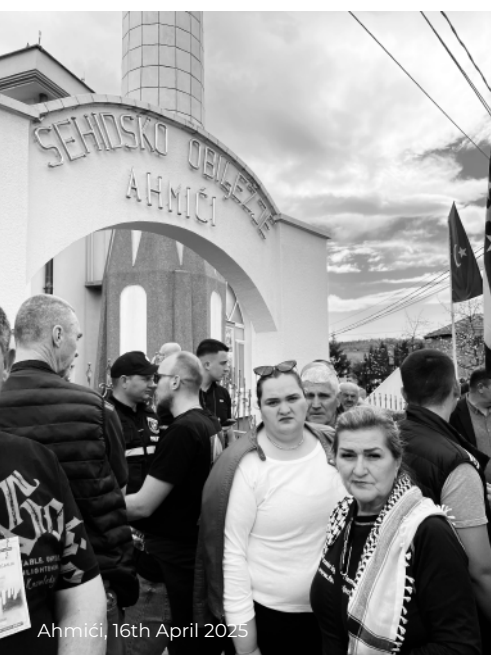
Ahmići, 16th April 2025

A lecture on transitional justice from multiple perspectives was held, with a focus on activities aimed at peacebuilding, strengthening social cohesion, and fostering trust among participants. This was the first Women's Peace Camp organised within the project 'Women's Caravan for Justice and Reconciliation', implemented by the Lara Foundation from Bijeljina.