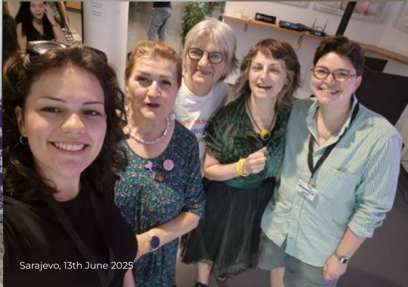
Sarajevo, 13th June 2025