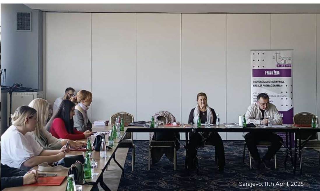
Sarajevo, 11th April, 2025