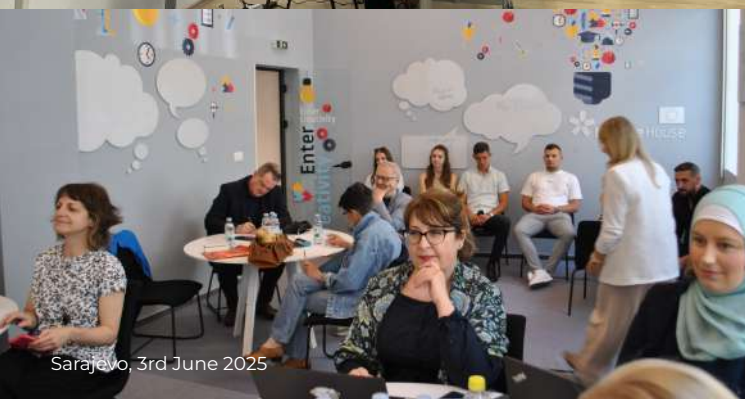
Sarajevo, 3rd June 2025