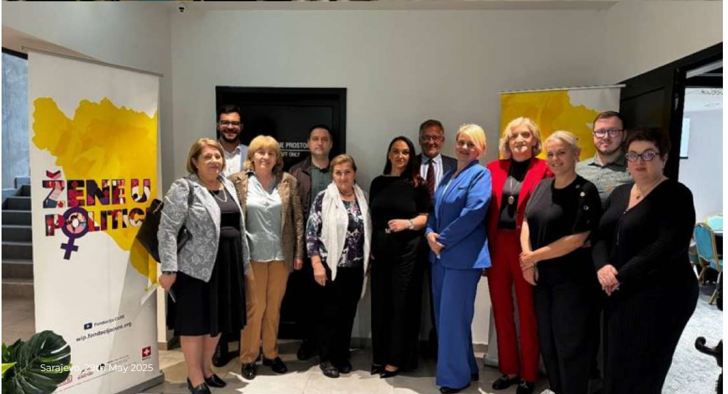
Sarajevo, 29th May 2025