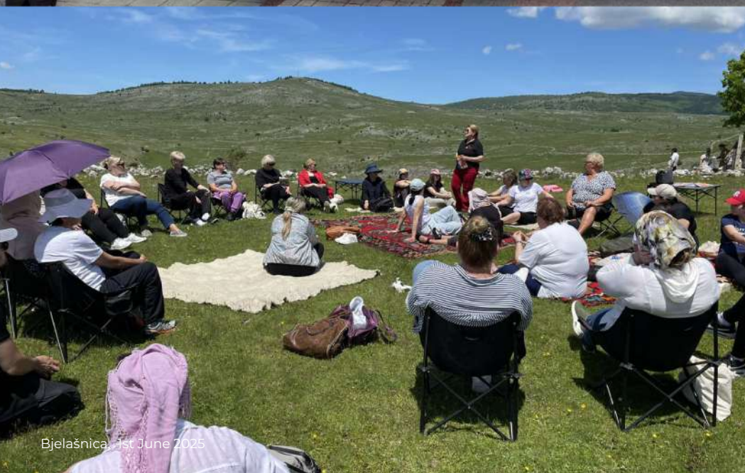
Bjelašnica, 1st June 2025