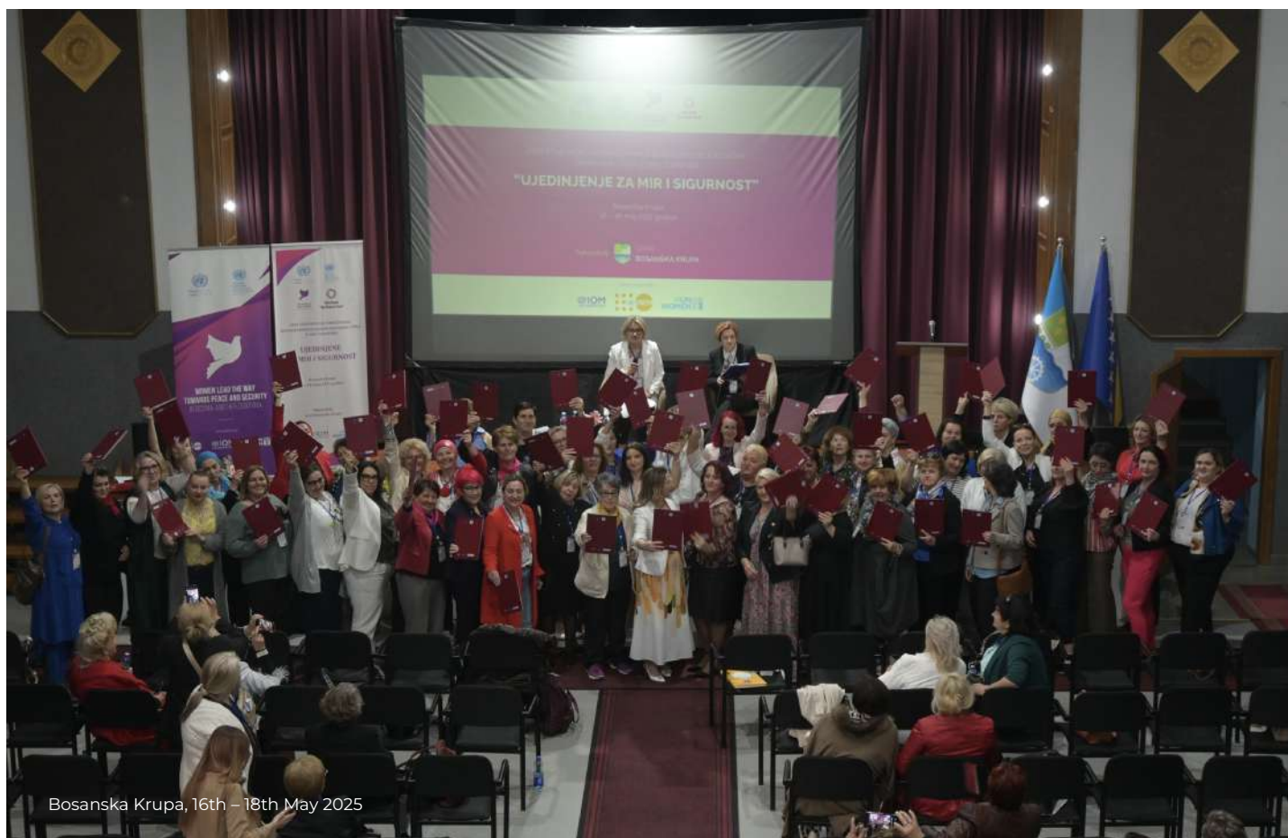
Bosanska Krupa, 16th – 18th May 2025