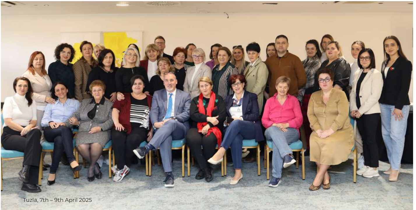
Tuzla, 7th – 9th April 2025