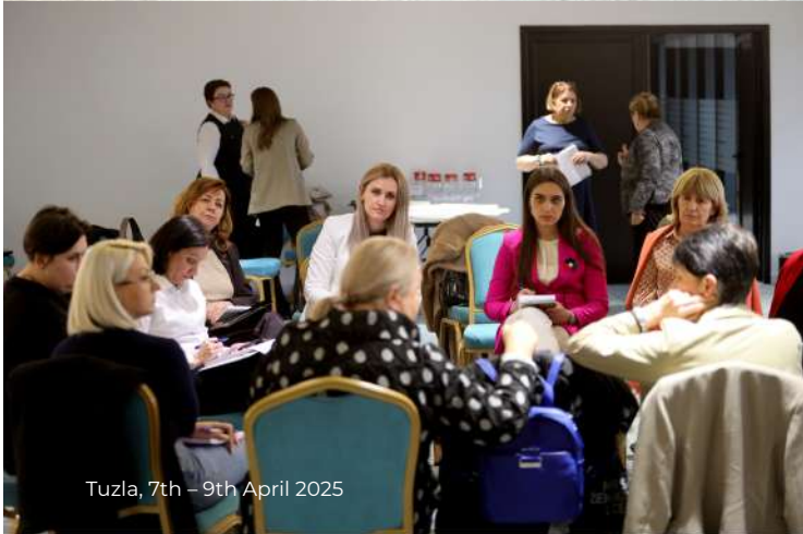
Tuzla, 7th – 9th April 2025