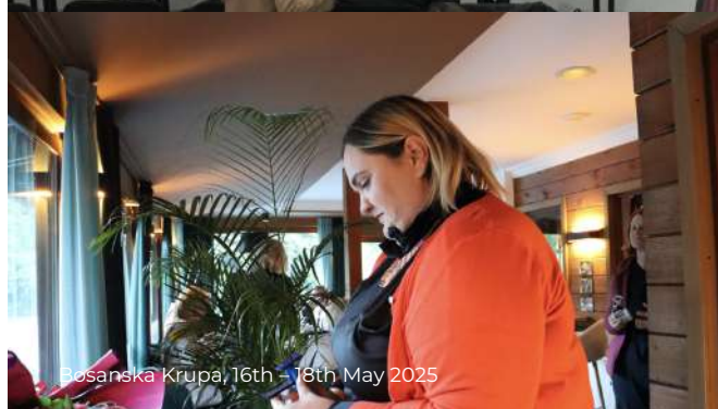
Bosanska Krupa, 16th – 18th May 2025