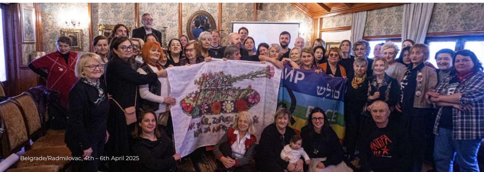
Belgrade/Radmilovac, 4th – 6th April 2025

The meeting discussed transitional justice from a feminist perspective, the genesis and evolution of wars, testimonies from conflict zones, as well as student uprisings, blockades, and marches. The exchange of experiences and viewpoints contributed to strengthening regional feminist solidarity and fostering a shared understanding of current socio-political challenges.