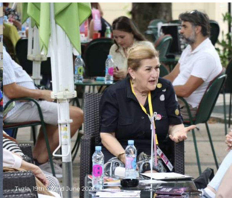
Tuzla, 19th – 22nd June 2025

A member of the CURE Foundation shared her views with the participants through a panel discussion. The festival was implemented within the framework of the European Dialogue in BiH ‘30 Years of Peace & What Next?’, as part of the session: ‘Monitoring – Do We Know All Our Rights?’