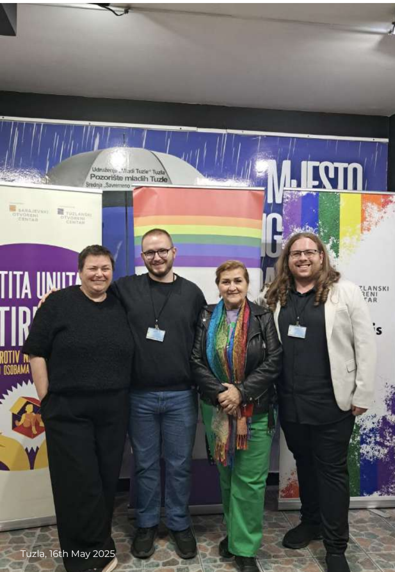
Tuzla, 16th May 2025

At the panel 'The Cultural Significance of Feminist and Queer Festivals', we presented the PitchWise Festival of Women's Art and Activism, emphasising its importance for connecting art, politics, and the struggle for human rights.