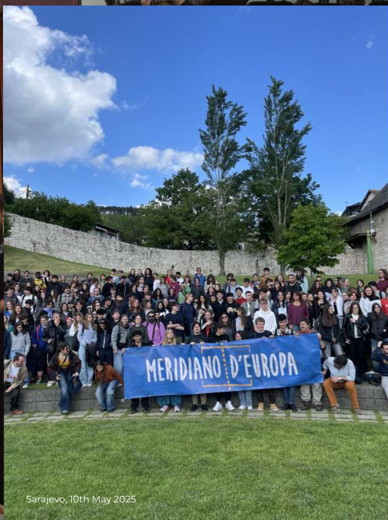
Sarajevo, 10th May 2025