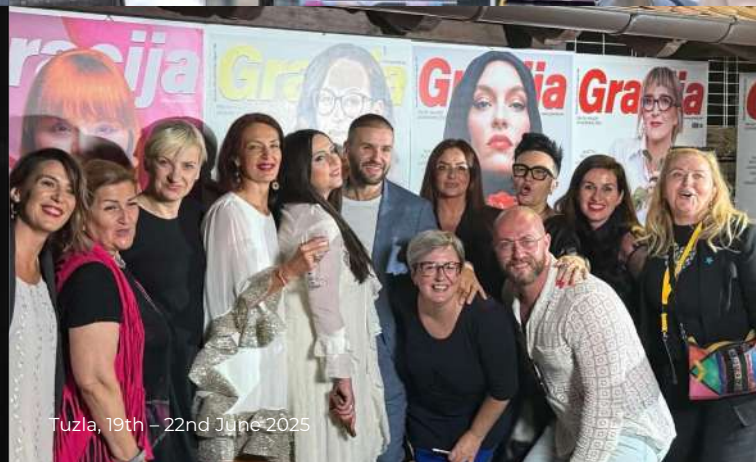
Tuzla, 19th – 22nd June 2025