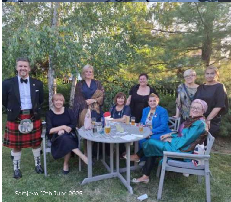
Sarajevo, 12th June 2025

We attended the celebration of the birthday of King Charles III. We met with many friends and colleagues from the worlds of politics, business, culture, security, cyber security, defence, and the non-governmental sector.