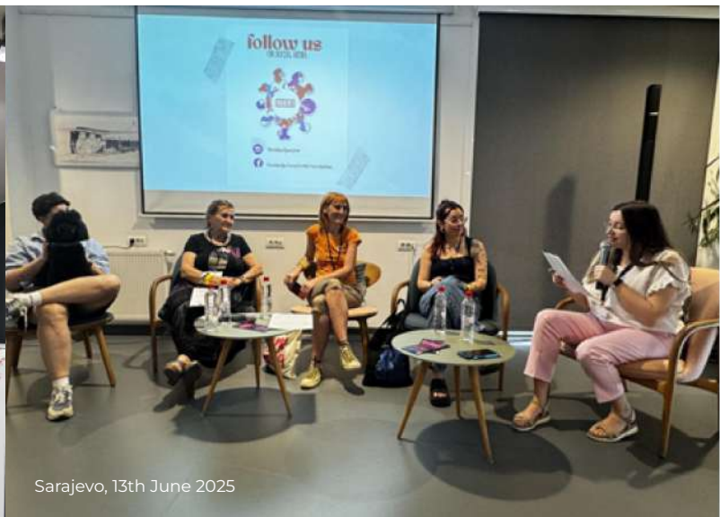
Sarajevo, 13th June 2025