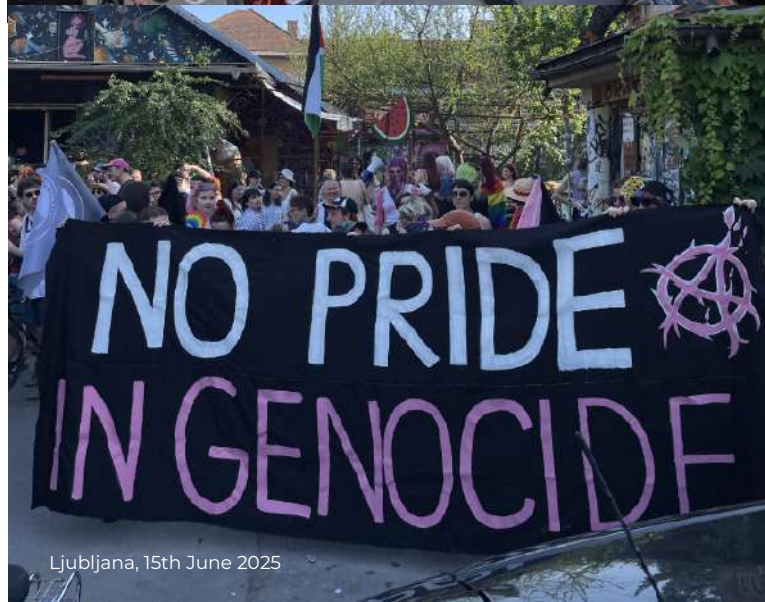
Ljubljana, 15th June 2025

We concluded the seminar by taking part in the Pride Parade under the clear message: 'No Pride in Genocide'.