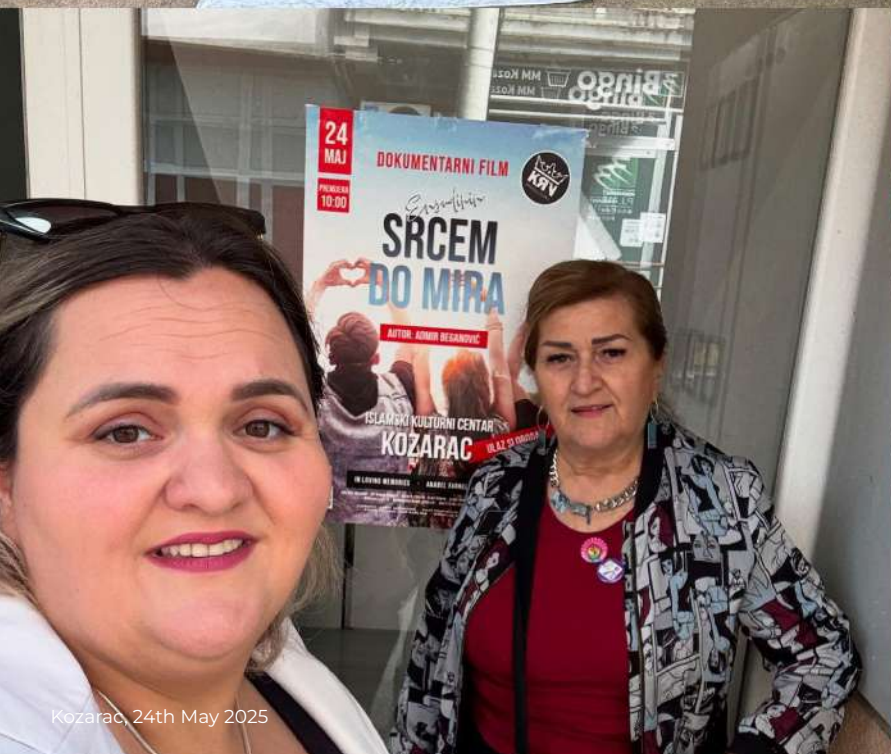
Kozarac, 24th May 2025