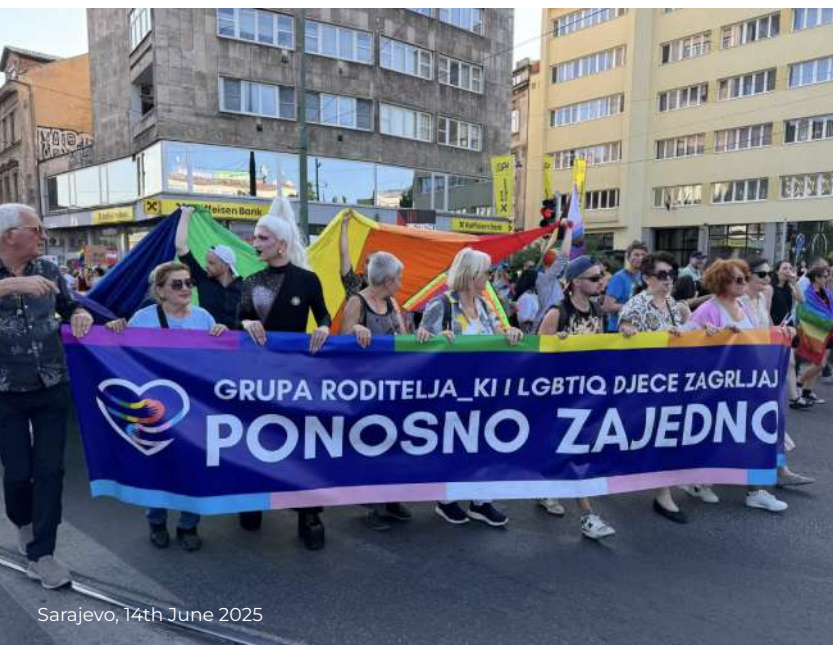
Sarajevo, 14th June 2025

Participants emphasised that “Sarajevo is a free city” and that it “belongs to Europe once again”, but also pointed out that the legal framework in Bosnia and Herzegovina still does not recognise the rights of the LGBTIQ+ community – particularly regarding the possibility of marriage and adoption for same-sex couples.