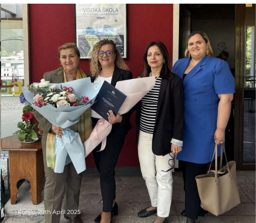
Konjic, 29th April 2025