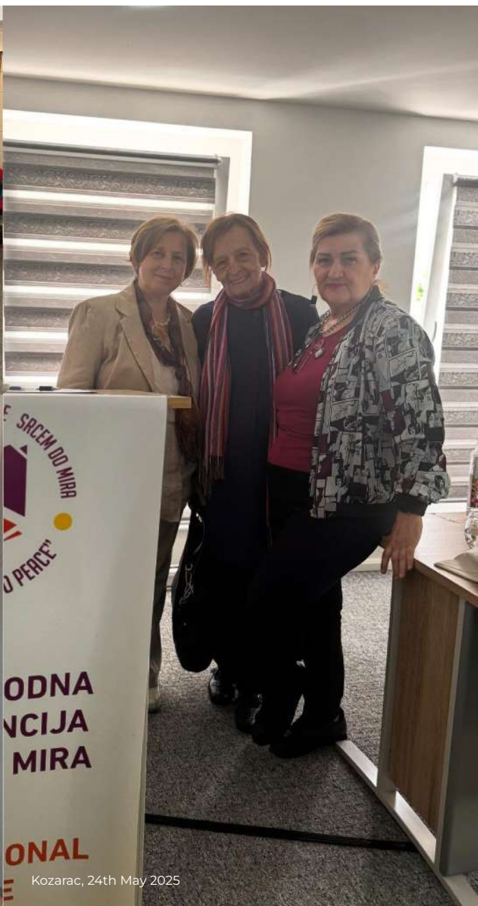
Kozarac, 24th May 2025