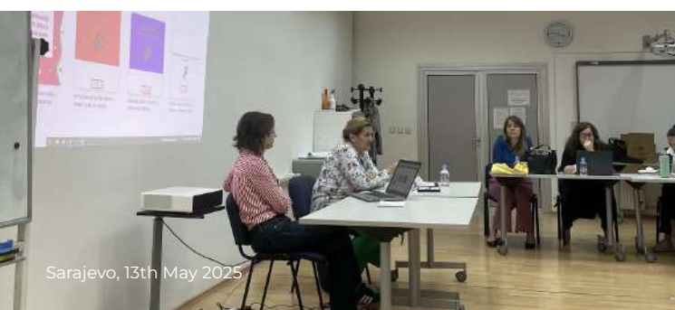
Sarajevo, 13th May 2025

At the beginning of June, we took part in a round table in Sarajevo on the topic ‘Why Geoparks in BiH and Why Marginalised Women’. We attended the presentation of the Initiative for the Establishment of a Geopark in Bosnia and Herzegovina. After ten years of work and advocacy, the idea has finally come to life, and the launch of this initiative demonstrates that dreams can be realised – especially when marginalised women are included.