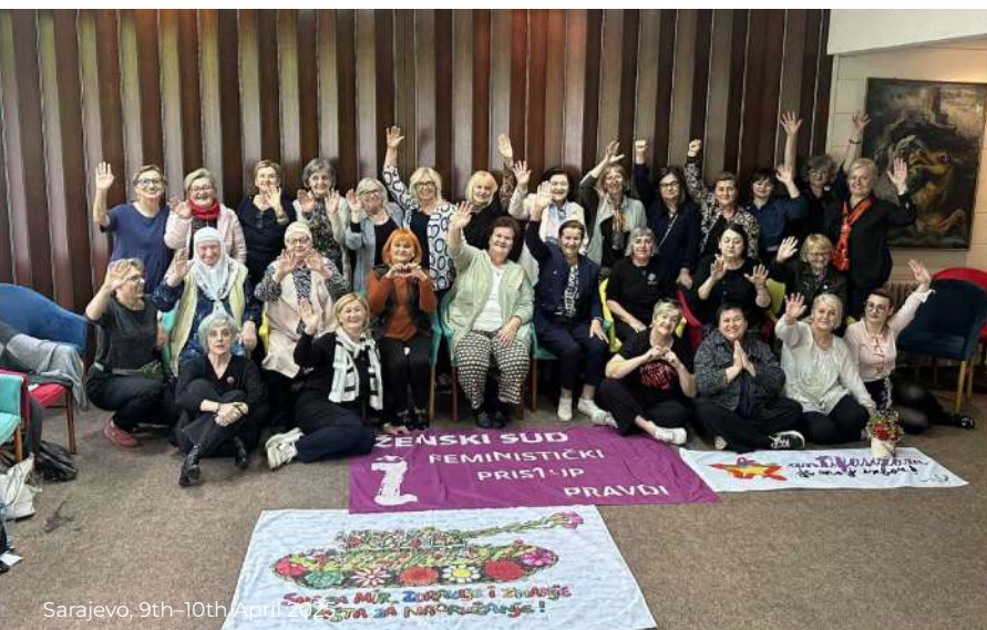
Sarajevo, 9th–10th April

We had the honour of attending the international conference 'With the Heart Towards Peace', organised by the association 'With the Heart Towards Peace'. Throughout the conference, women who have fought for justice and reconciliation for decades shared inspiring messages and experiences. Discussions focused on the role of women in peacebuilding processes – both during wartime and in post-conflict societies. We had the opportunity to reconnect with our dear peace activist colleagues, exchange experiences, and remind ourselves of the importance of our shared struggle for peace.