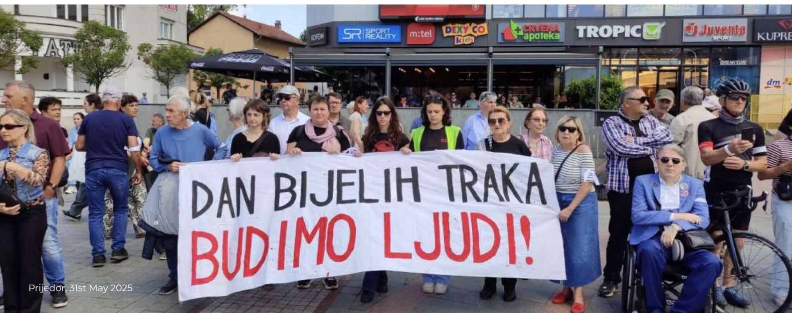
Prijedor, 31st May 2025

Women shared personal stories about their ability to overcome challenges and prevent retraumatisation, as well as ideas on how to become initiators of change in their local communities. A total of 35 women participated.