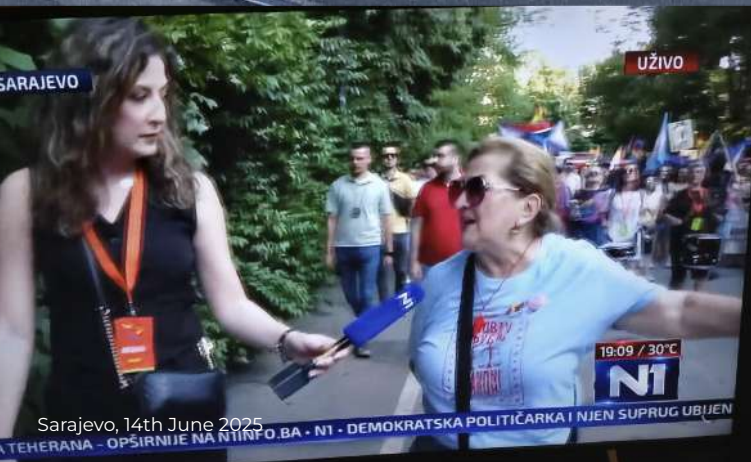
Sarajevo, 14th June 2025