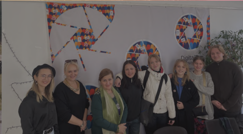
Radni sastanak na Trebeviću / Susret sa mladima iz Švedske