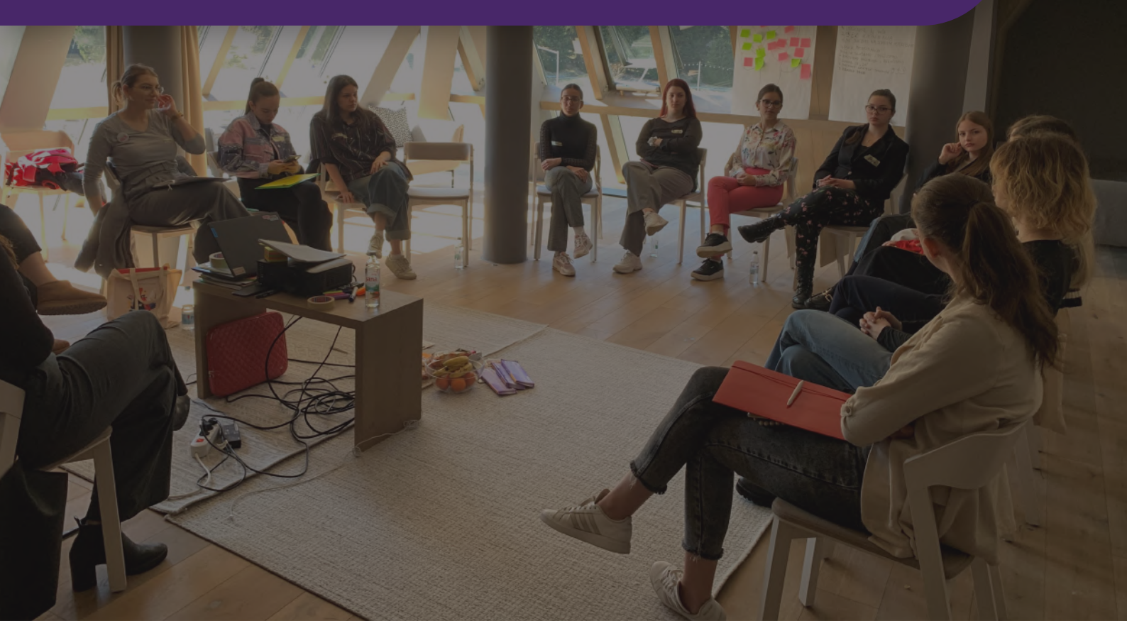
Training of Trainers, Igman, March 22 – 24, 2024

Foundation CURE, in collaboration with UNICEF Bosnia and Herzegovina, is implementing the “EmpowerHER” project. This six-month program, running from February to August 2024, is designed to educate and empower young women to recognize and combat gender-based violence and to share their knowledge through workshops in their communities. The project is especially significant in rural areas of BiH, where gender-based violence is often a taboo topic.