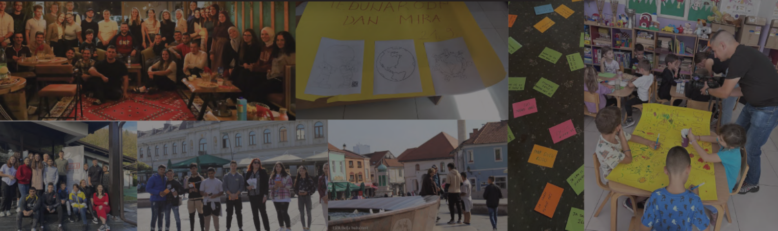
Bijeljina / Living Library, Ilidža / Workshop and Rose Planting, Kalesija

The CURE Foundation, in collaboration with the Association Center for Integrative Inclusion of Roma and Romani Women OTAHARIN Bijeljina, the Association of Romani Women Bolja budućnost from the City of Tuzla, the Jadar Women's Association, and the Foundation for the Advancement of Education and Culture Izvor nade Ilidža/Sarajevo, organized a Peace Camp from November 9th to 12th, 2023, at Hotel Zlača in Busovača.