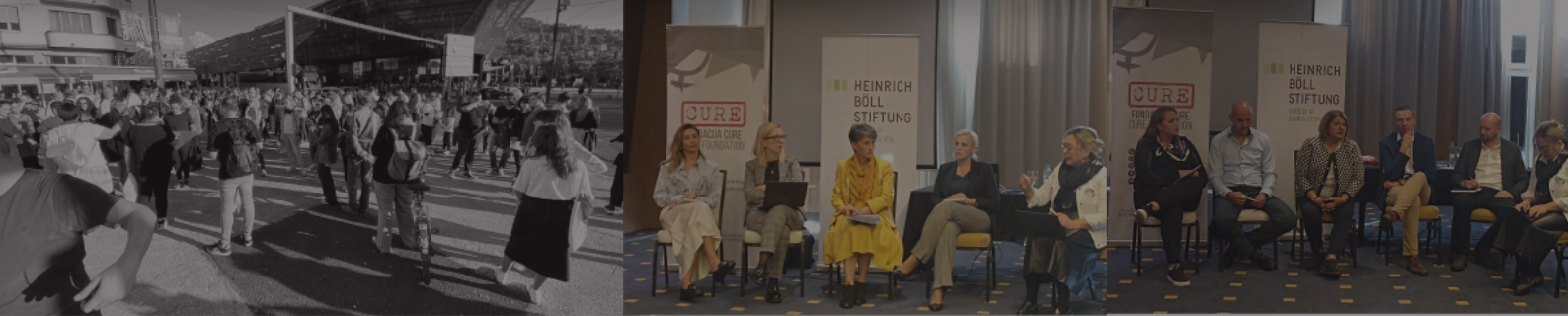
Meeting "United against Violence", Ilidža

During the three-month project, a series of activities were conducted with the aim of addressing the increase in violence against women and femicide in Bosnia and Herzegovina and creating a framework for future action. The project began with the participation of women from Bosnia and Herzegovina at the XVIII Festival of Women's Art and Activism PitchWise. The festival attracted significant interest from participants, especially citizens of Sarajevo, highlighting the importance of such events in promoting art, women's rights, and combating violence. Following the festival, a three-day meeting titled "United against Violence" was held, bringing together relevant participants to present their initiatives, proposals, and previous work with victims of violence, which is particularly important considering the recent increase in violence against women and femicide in Bosnia and Herzegovina.