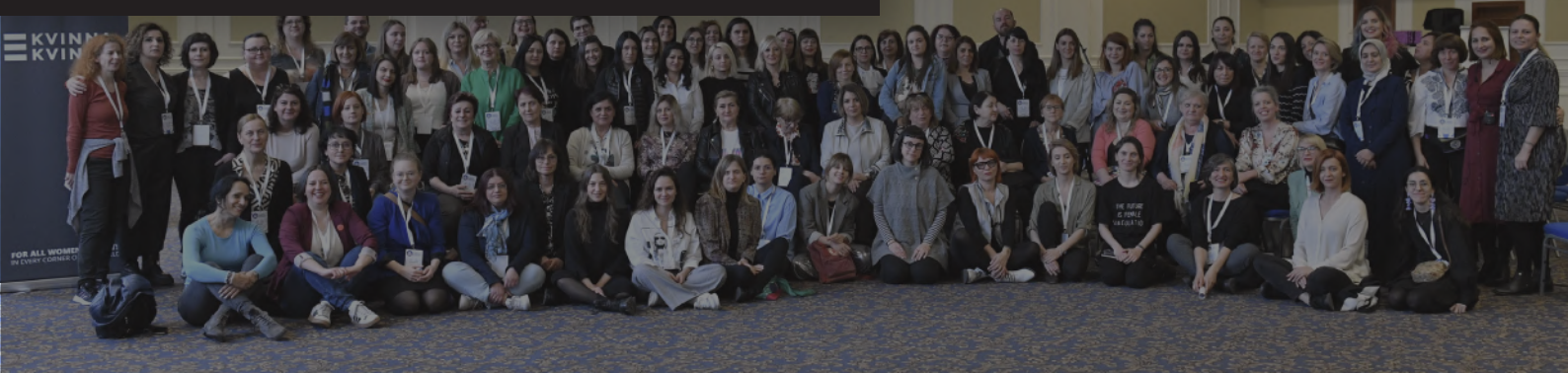
KTK conference in Skopje, March 2023

Since 2021, the CURE Foundation has been implementing the Advocacy for Women's Rights project in Bosnia and Herzegovina. "Feminist advocacy activities for economic empowerment and socio-economic support measures for most marginalized groups of women" form a separate part of this project. The goal of the project is the development of adequate strategies and the adoption of institutional measures for the economic empowerment of marginalized groups of women, with a special emphasis on women who survived domestic violence in the FBiH.