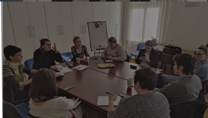
*Visit from Italian peace activists