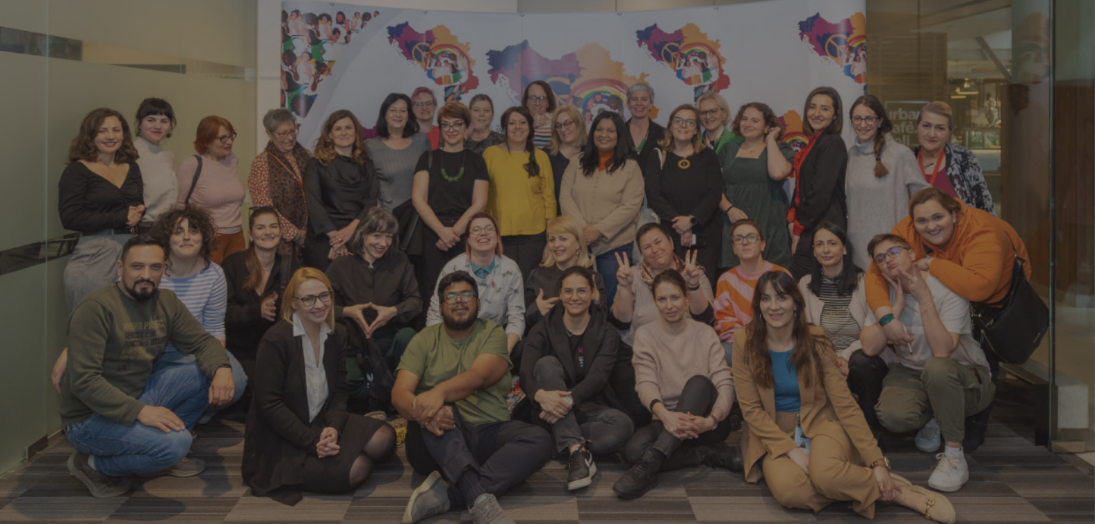
Meeting - Movement-led approach - Gender Justice