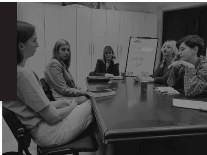
Bookclub at the CURE Foundation

Since the beginning of 2023, the CURE Foundation has been organizing a Bookclub for members, activists, volunteers and all other people who are interested in getting together once a month to discuss different feminist topics. Bookclub is a safe, non-judgmental space with