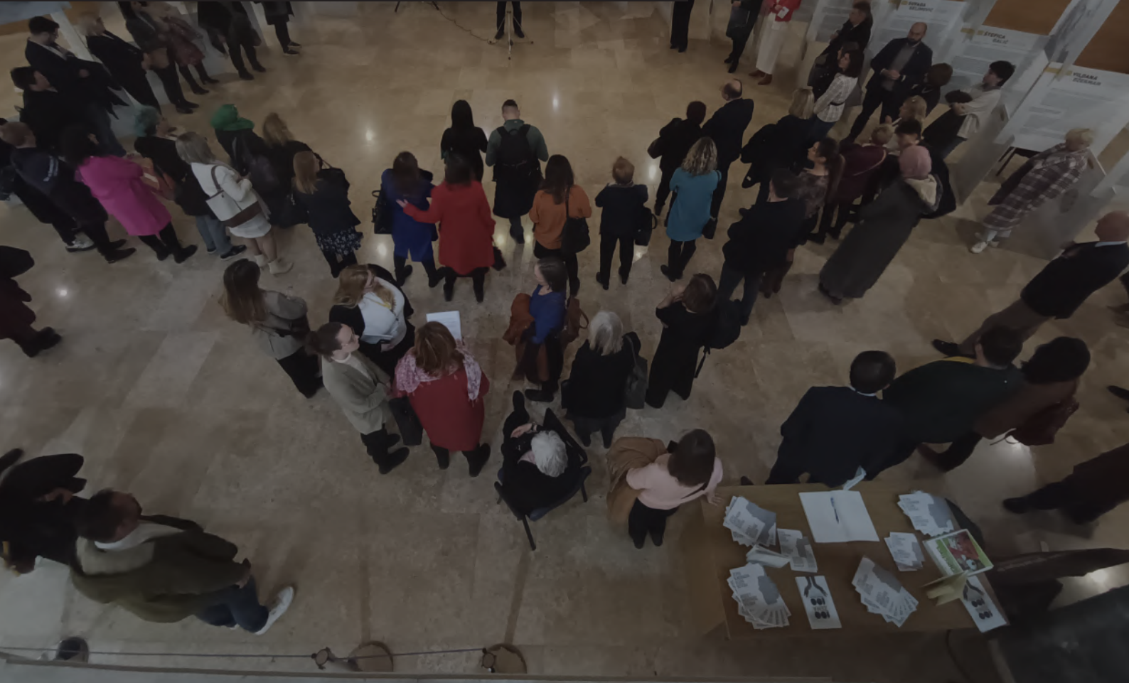
Opening of the exhibition in the BiH Parliament

The CURE Foundation is one of thirteen women's activist organizations that are members of the "Peace with a Woman's Face" Initiative led by the "Lara" Bijeljina Foundation and the "HO Horizonti" Association Tuzla. The initiative was formed as a response of women's rights defenders to the exclusion of women from transitional justice policies and the insensitivity of these policies to the damage and suffering that women in BiH endured during the war and in the years of