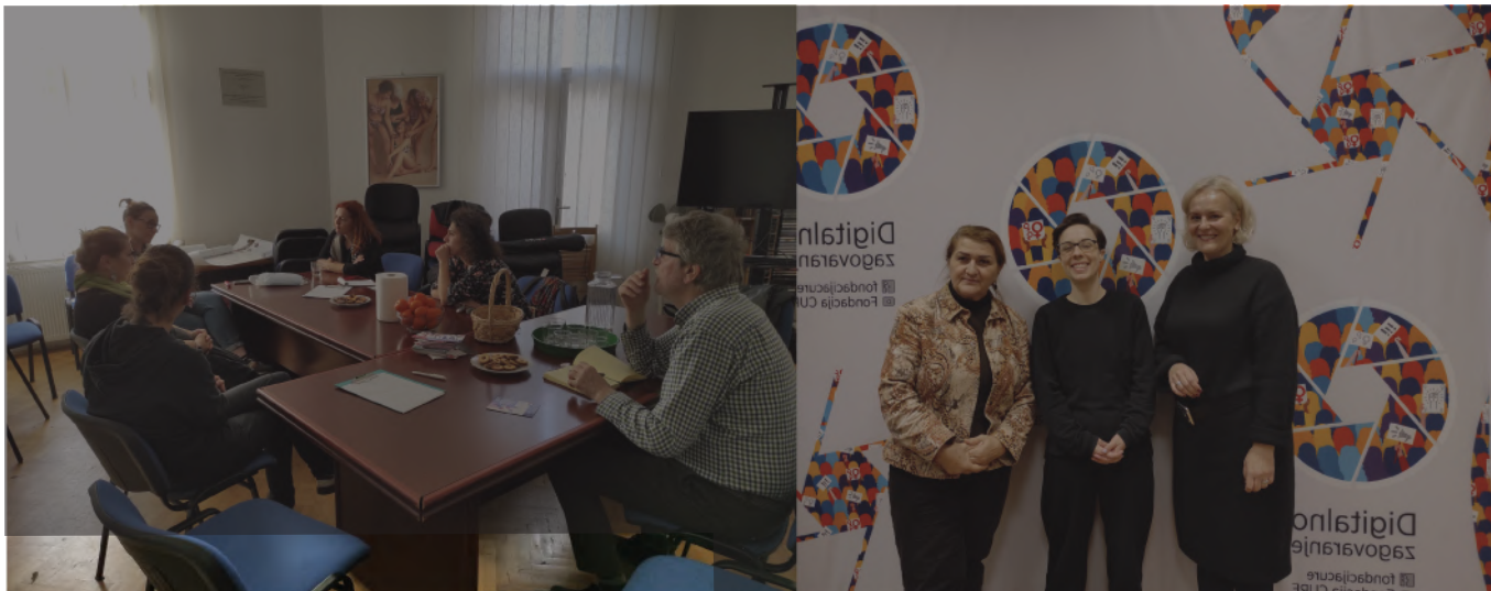
*SOC and SAAF visit

We held a regional meeting organized by the "Association of Disabled Youth of Montenegro" (the official name of the organization); received a group of peace activists from Italy for a visit with the aim of filming a documentary video on the topic of peace processes in Bosnia and Herzegovina; provided our premises to the INFOHOUSE Association for the organization of a press conference, as well as to the Pride Organizing Committee for the organization of a press conference in Sarajevo on the occasion of the attack in Banja Luka etc. Please see below some of the photos taken at the premises of the CURE Foundation.