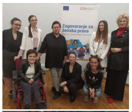
Zagovaranje za ženska prava Women Human Rights Advocates