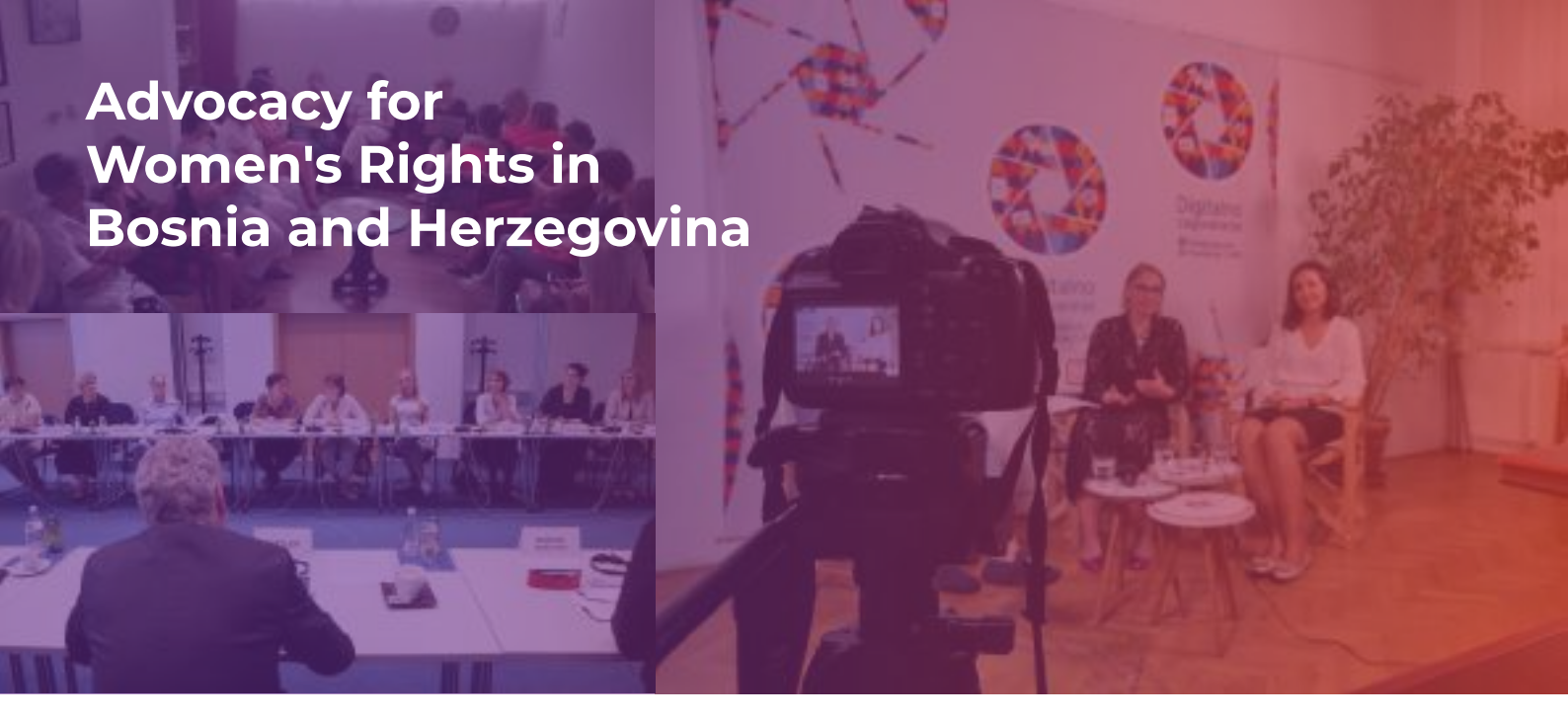
* Digital advocacy - PW festival announcement, September 7, 2022 *Advocating for women's rights, KtK workshop in Mostar, August 5, 2022 *Meeting with Johan Sattler, September 6, 2022

In our advocacy efforts to improve the position of women and girls, we learn from the best! Our cooperation with the donor partner organization Kvinna till Kvina from Sweden includes networking with great women as well as learning about other cultures and political systems.