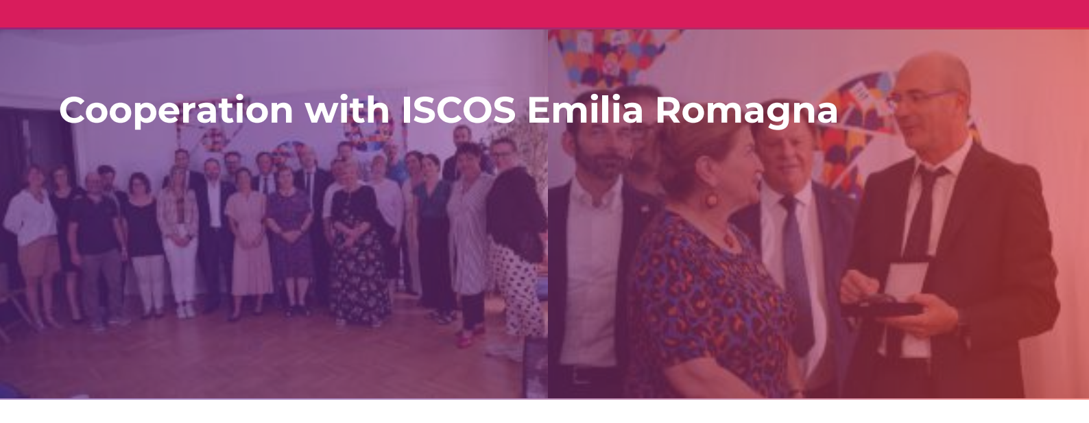
*ISCOS and networking with our dear friends from Italy, July 12, 2022

Our long-term cooperation with friends and partners from Reggio Emilia (Italy) was marked in July this year with an institutional partnership between the municipality of Centar Sarajevo and the municipality of Reggio Emilia from Italy.