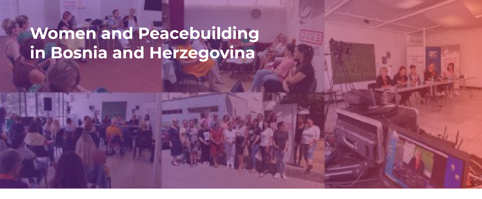
*Women and Peacebuilding, workshop in Mostar, August 6, 2022 *Women and Peacebuilding, workshop in Lipnica/Tuzla, August 28, 2022 * PANEL The Fearless Heroines of Peace, September 9, 2022

The project "Women and Peacebuilding in Bosnia and Herzegovina" aims to raise awareness of citizens about the need to include women in all phases of peace negotiations and peacebuilding.