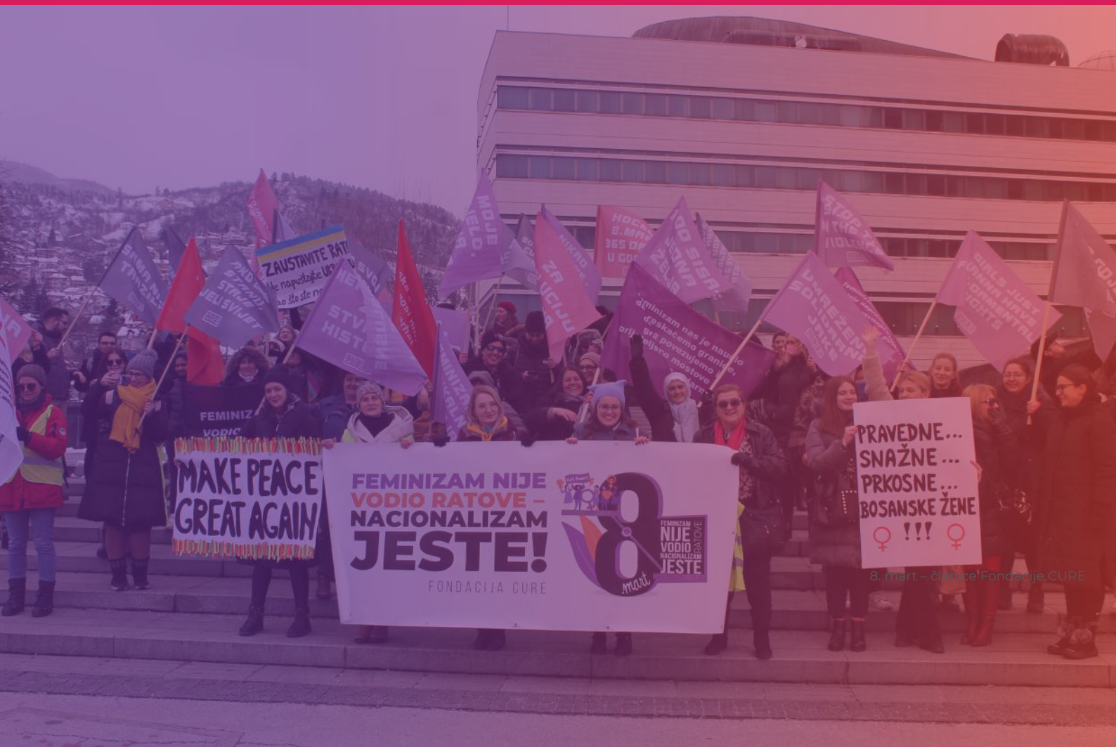
8. mart - dan žena Fondacije CURE

Standing for the 8th of March - CURE Foundation organized a March for the 8th of March to mark the International Women's Day and to draw attention to the fact that even in times of "peace", in a time without natural disasters and