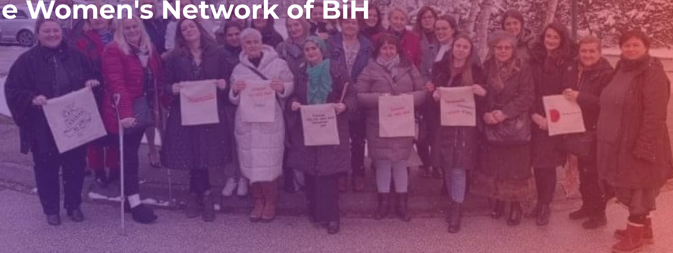
March 2022 - The conference of the Women's Network of BiH entitled "ZERO Tolerance of Violence Against Women - Solidarity and Support"

The Women's Network of BiH has focused its activities on strengthening the advocacy capacity through the technical improvement of our social platforms. Our website www.zenskamreza.ba continues to broadcast the latest news regarding the quality of life of women and girls in Bosnia and Herzegovina, and is a resource for all those who seek more information. Our participation in meetings on advancing the position of women